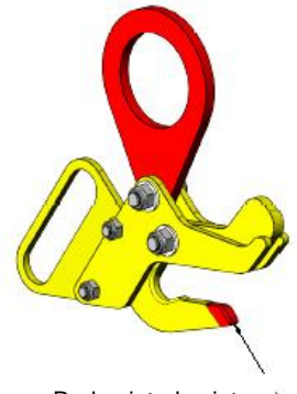
Red painted point

The hook opens automatically when laying down the load and the hook can be pulled of the eye (n° 4 and 5)